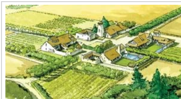
SELF-SUFFICIENT: The Sky development in Clarksville will be a proving ground for energy-conserving technology.

The development will feature horse-riding trails and orchards but also will incorporate amenities such as tennis courts and spas. Home sites, from courtyard lots to two-acre farm villas, will each include a garden, says Sanford. The land on which the development will be built was a flower farm for nearly 100 years. Many acres have reverted to cypress wetlands and pine forests; all 105 wetland acres